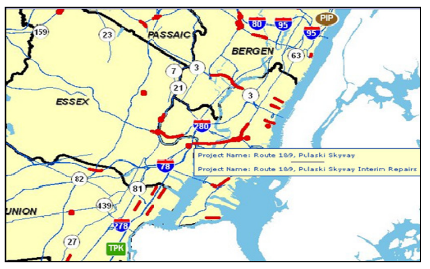
Map Viewer screen shows the location of projects

Displays interactive (pop-up) geographical map for viewing of STIP projects. The projects can be queried and selected on screen with a link to the detail project review information.